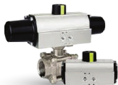
Scotch & Yoke Actuator